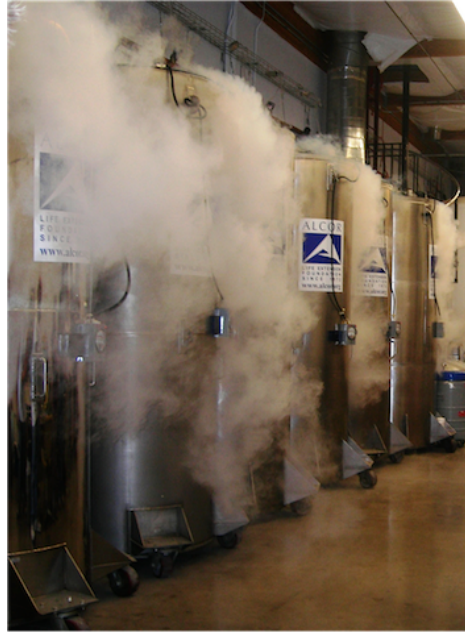
Cryo-containers (called dewars), at the Alcor Life Extension Foundation.